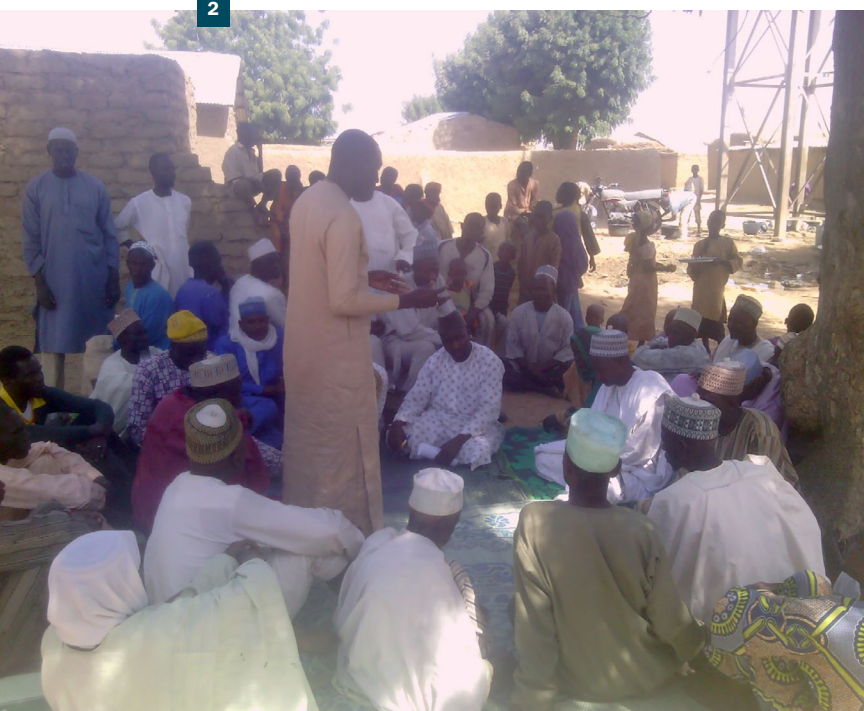
2 Male support groups making presentation on field visit in Fagoji, Zamfara.